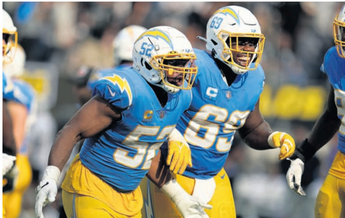
Los Angeles Chargers linebacker Khalil Mack (52) celebrates defensive tackle Sebastian Joseph-Day (69) during the second half of an NFL football game against the Las Vegas Raiders in Inglewood, Calif., Sunday, Sept. 11, 2022.

Mack and Joey Bosa — who had a combined 4 1/2 sacks and 16 QB pressures